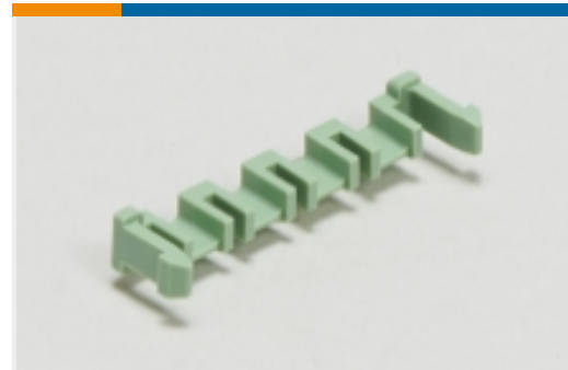
PCB Latches, Locks &amp; Retainers(2)